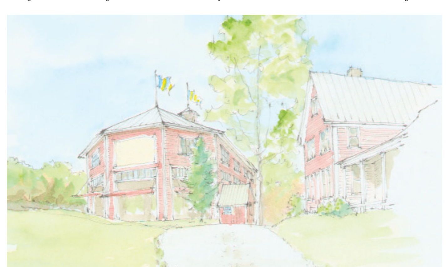
The great barn, located near the farmhouse, is on the footprint of an original dairy barn. Vitzthum took the 45x90-ft. rectangle and added two octagonal ends to accommodate two circus performance rings. Its modern steel frame for aerial acrobatics would be interwoven with a traditional post-and-beam construction.

The other cluster, closer to the farmhouse, is for the troupers who currently live in trailers. It includes cabins, the existing farmhouse, which is used for administration, practice and performance tents, and the great barn. Vitzthum set this barn on the 45x90-ft. footprint of an original dairy barn and modified it with octagonal ends to incorporate two circus performance