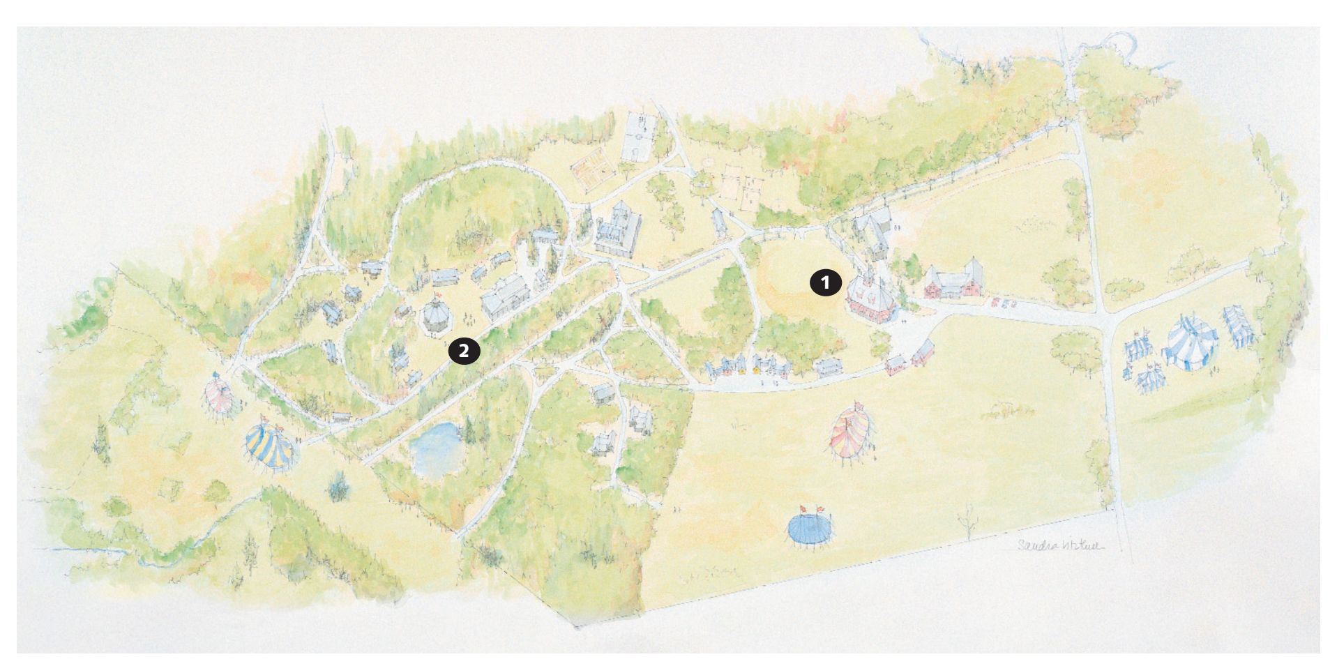
The master plan for the combined children's circus and summer camp in northern Vermont divides the area into two major clusters. The great barn (1) with its octagonal ends and flags is the main building in the troupe area, while the summer camp centers on an octagonal training barn (2). All drawings: Sandra Vitzthum Architect