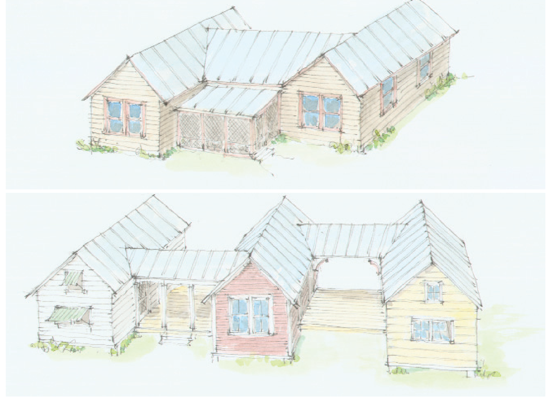
The cabins for coaches (top) and troupers are clustered in their respective areas. Cabins for the campers are similar in size and style.

Although the camp hasn't been able to set a date to begin construction, because it was one of the many nonprofits that suffered in the wake of 9/11, it is still hopeful about moving ahead with the plan sometime in the future. •